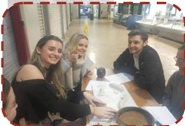
Chinese New Year Making dumplings In Grainger market 2022 By Shirley Knott